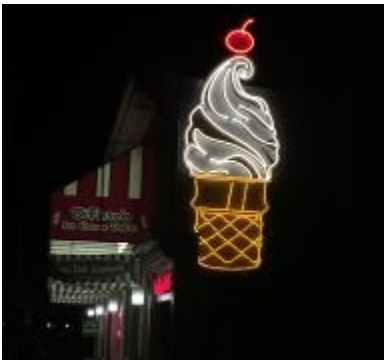
Ice cream anyone? I don't have a photo of the incline up, but we didn't have ice cream, everything is cash only.