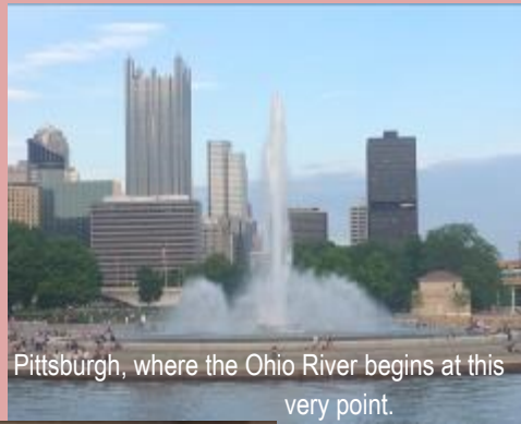
Pittsburgh, where the Ohio River begins at this very point.