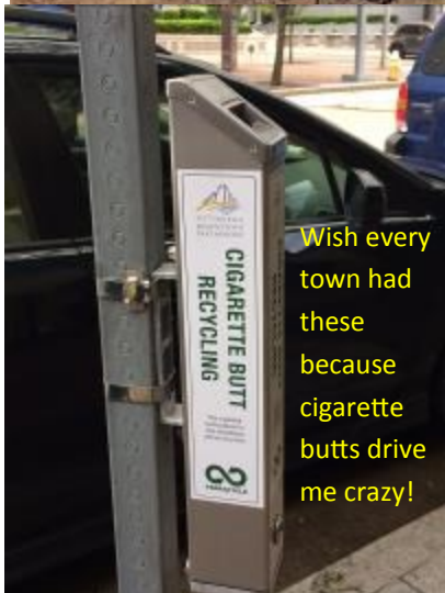
Wish every town had these because cigarette butts drive me crazy!