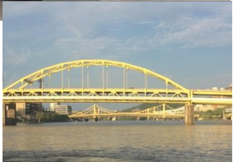
A few cool bike racks. The small bridge replicates an actual yellow bridge in downtown Pittsburgh.