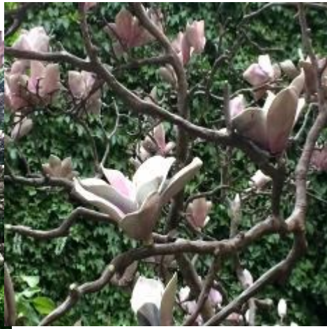
An amazing public art installation in a pocket park. The two Magnolia trees are made of metal and all hand painted. It was early spring in PA and you had to look twice to realize they were not real.